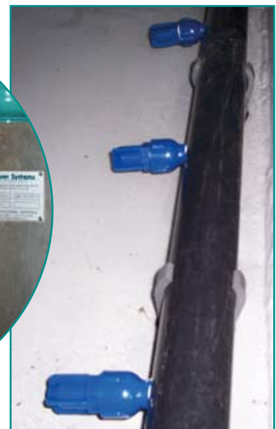
Highly efficient sweeper system reducing sediment