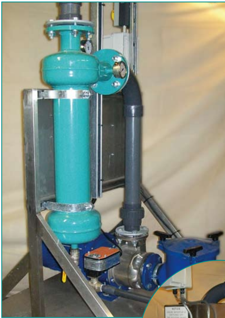
Separator package, stainless steel skid

Cooling Towers and Evaporative Condensers are highly efficient air scrubbers and the introduction of airbourne contaminant and other particulate matter will inevitably result in high turbidity through solid suspension and ultimately deposition of sediment at low velocity areas.