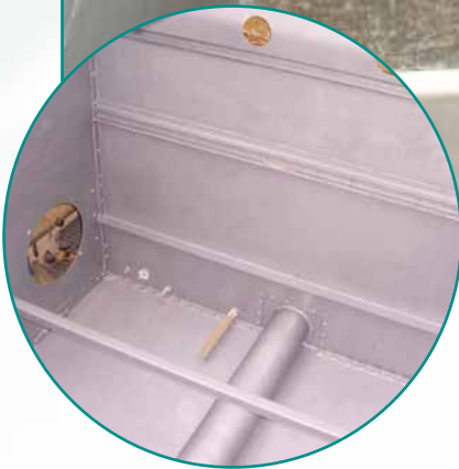
Surface preparation for high performance paint system