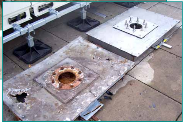
Replacement component parts sourced or remanufactured